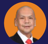
YB Datuk Armizan Mohd Ali Minister of Domestic Trade and Cost of Living

Despite these measures, only 7% of eligible companies submitted unaudited financial statements, indicating the need for more inclusive thresholds.